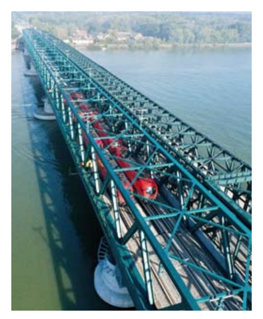
Tulln Danube Bridge

Experience, technical expertise and a thirst for innovation are the three pillars on which this department's market success rests. For customers, this means that they can rely on PORR for every complex task in the course of building up the world's rail networks.